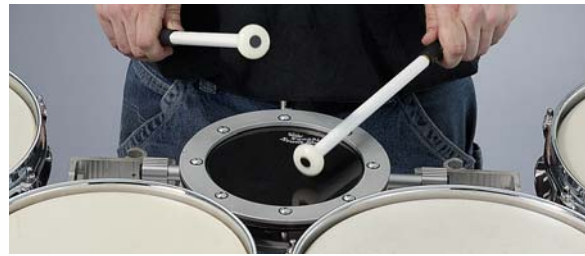
Adjustable Accent Snare Mounting Bracket For attaching Accent Snare to Tom Rail Remo / Pearl MH-30SN-PL Yamaha MH-30SN-YA