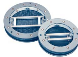
TSS High Tension Accent Snare with Black Max® drumhead and snare wire