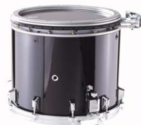
Tornado Snare MAXIMUM RANGE 10" X 14" SHELL with Gut tone snares TS-4214-70