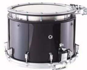
Hurricane Snare EXTENDED RANGE TSS 8" X 14" SHELL with wire snares TS-4114-70