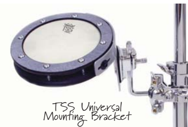
TSS Universal Mounting Bracket

TSS can add sound dimension to your drumset that you never imagined. As a dynamic accent, TSS adds a crack that will open a whole new world of sound possibilities. Its rugged Acousticon® frame looks handsome in its high-tech finish and will stand up to the rigors of practice and performance.